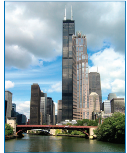
311 S. Wacker featured in front, to the right of Willis Tower

Although our lease begins on January 1, 2011, we won't officially move in until our lease at 212 W. Van Buren expires at the end of January. Please stay tuned for an official announcement of our move in 2011, and we hope that many of our readers can stop by and visit our new location.